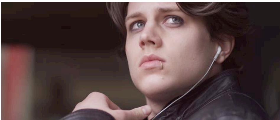
Annabelle – Leslie Easterbrook ( Devil's Rejects, Police Academy )